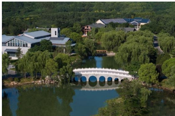
Photo: The Garden of New World Shijiazhuang Hutuo Resort

New World Hotels and Resorts, an upper-upscale hotel brand under the management of New World Tongpai Hotels Group, announces the grand opening of New World Shijiazhuang Hutuo Resort. The property was developed by Shijiazhuang Real Estate Group Co., Ltd. This resort combines traditional culture with modern aesthetics in perfect harmony and is situated in a significant area that connects downtown Shijiazhuang with Zhengding Ancient City. It creates ‘a modern fairyland’ filled with Eastern charm for guests. The debut of New World Hotels and Resorts in Shijiazhuang, with the grand opening of its first property, marks a significant milestone in the brand's rapid expansion.