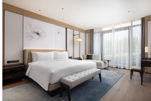
Photo: The Room of New World Shijiazhuang Hutuo Resort

The resort features two restaurants: ‘WEI Kitchen’ which is a fusion of Chinese and Western cuisines, offering a buffet service that includes classic French dishes, Italian cuisine, and unique Middle Eastern delicacies. The Chinese restaurant specializes in high-end Cantonese cuisine, classic Huaiyang dishes, and innovative Sichuan cuisine, with Cantonese and Huaiyang cuisines being particularly renowned. There are a total of 20 private dining rooms, with the largest one offering a lake view and accommodating up to 36 people’s gatherings.